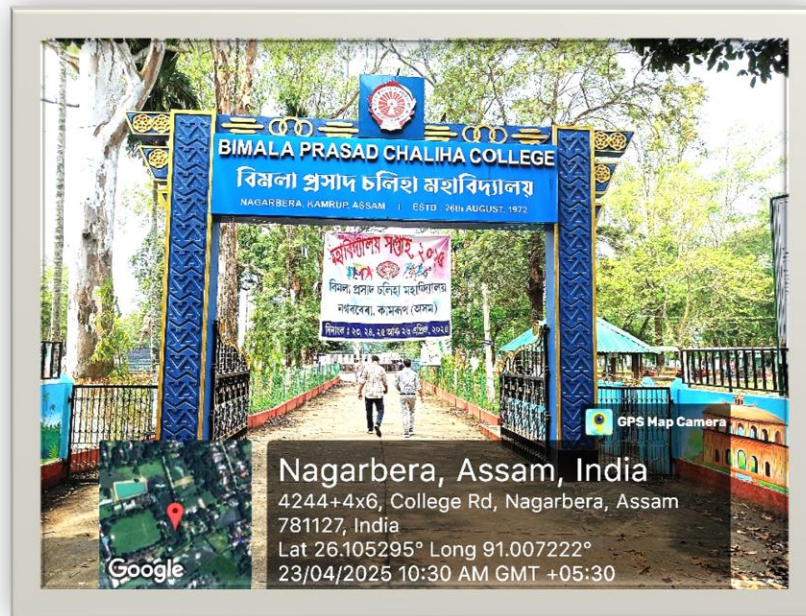
Front view of the College Campus

The purpose of education is to make good human beings with skill and expertise. Enlightened human beings can be created by teachers.....Dr. APJ Abdul Kalam