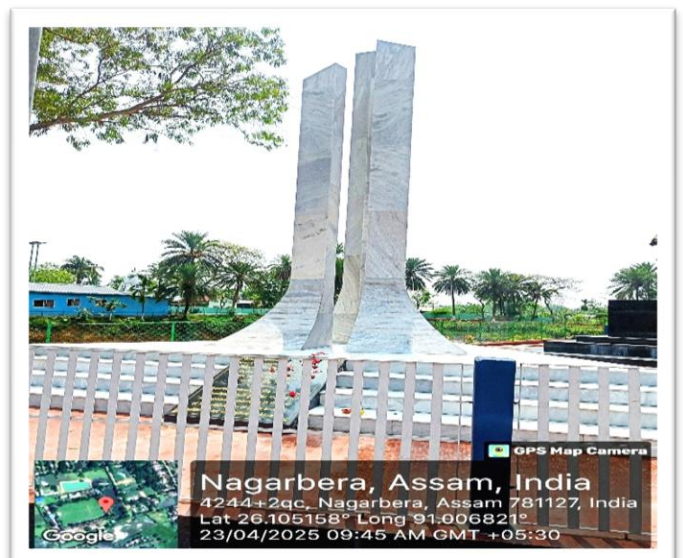
College Campus at a glance